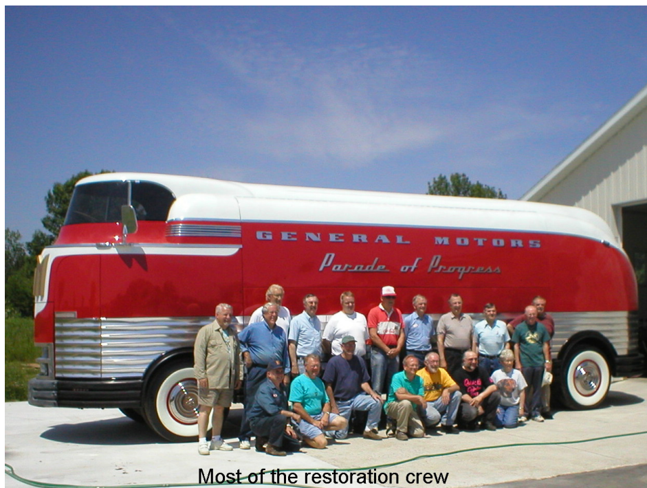
Most of the restoration crew